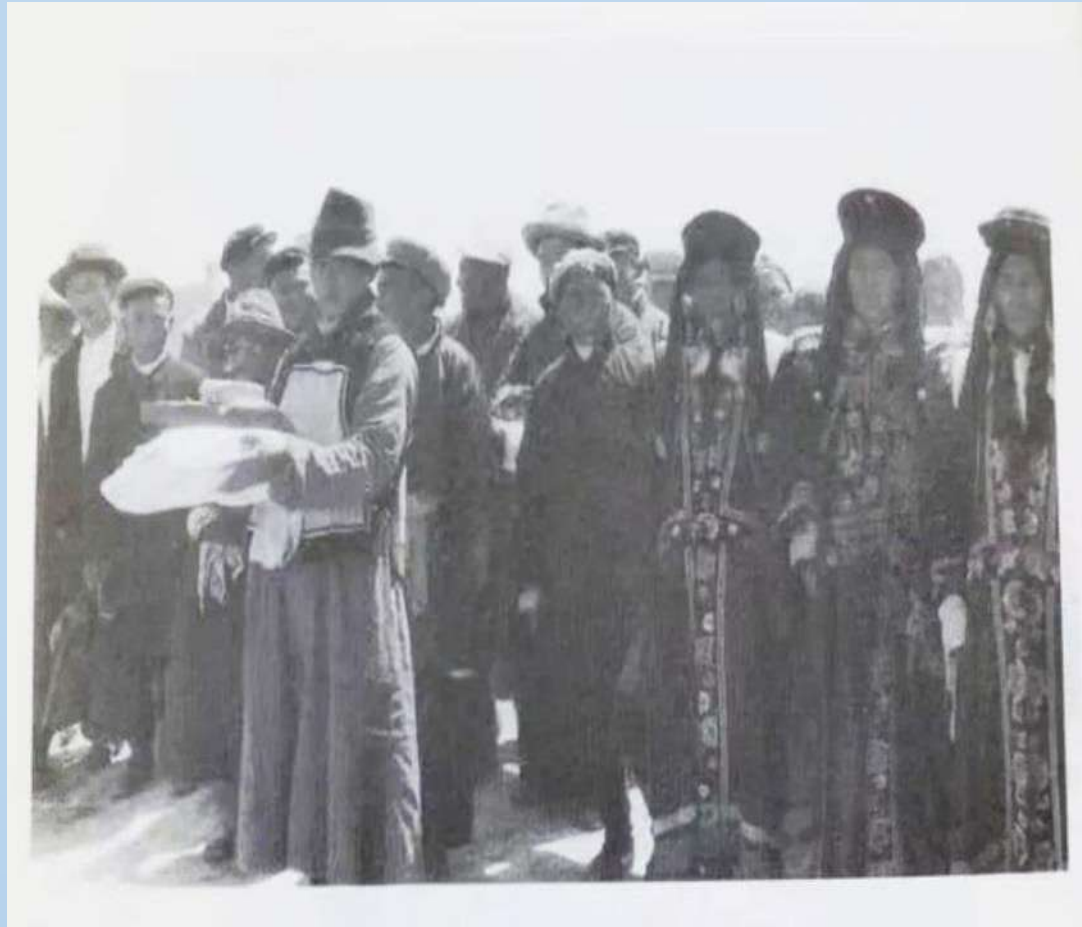
Traditional clothing of Ölöts living in Dörüljin County in Tarbagatai Area Of Xinjiang, China, (photo by Todayeva 1956)