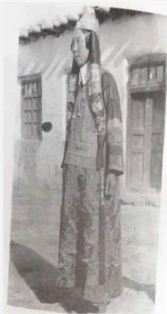
Women clothing of Torghud in Bayangol (Photo by Todayeva, 1956)