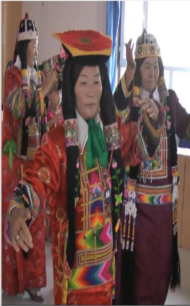
Women clothing of Hoshuud in Bayangol (Photo by I.Dawa, 2014)