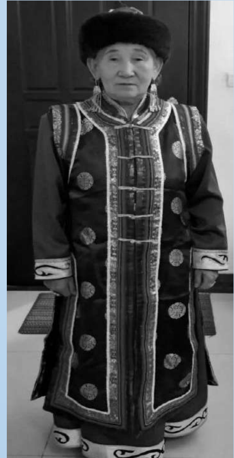
Traditional clothing of Ölä Tribe living in Ili Area of Xinjiang, China, (1957)