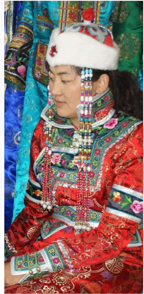
Women clothing of Torghud in Bayangol (photo by L.Jinhua , 2018)