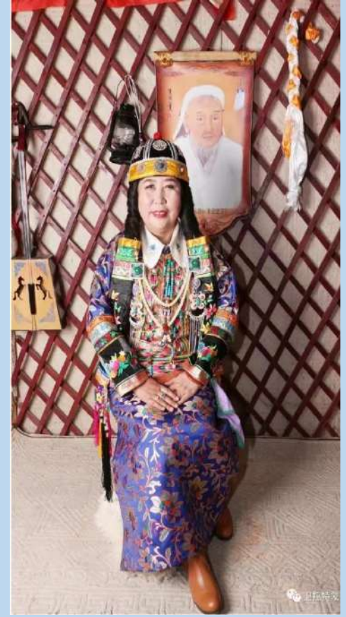
Women clothing of Harausun Torghud (photo by Mi.Shura ,2015)