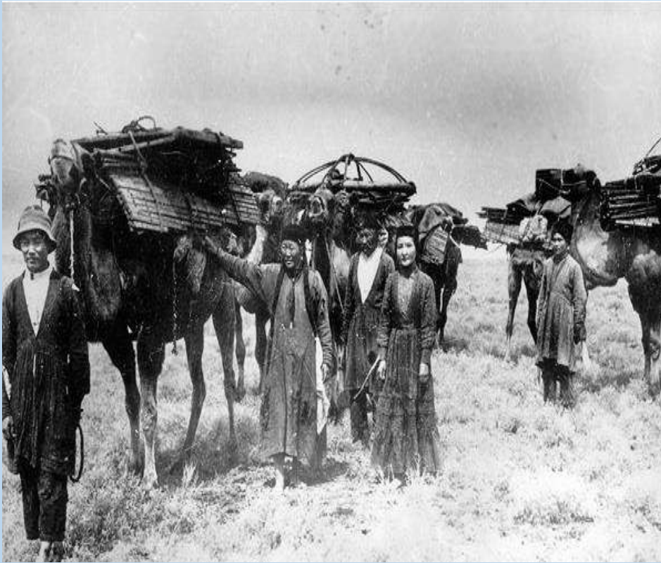
Clothing of Torghud, late 19 th century