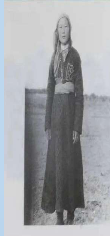
Women clothing of Torghud in Hobugsairi